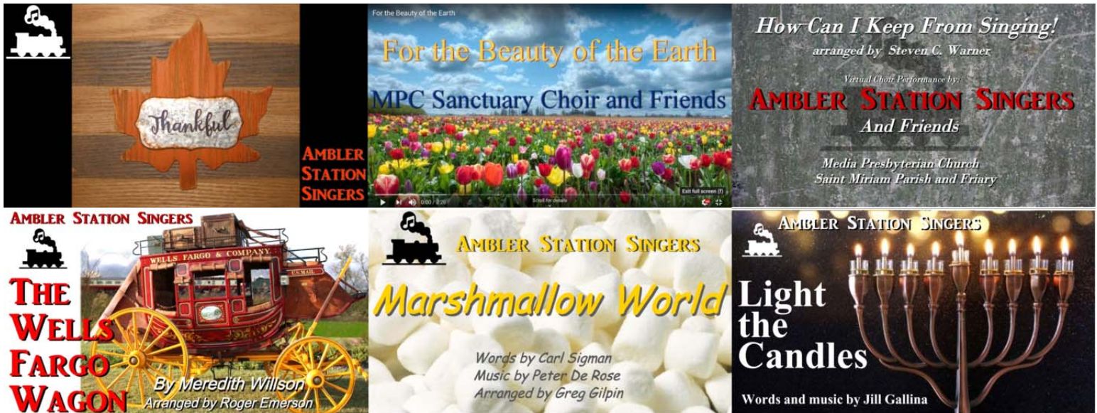
Above The growing collection of Virtual Choir videos we have done. The bottom three will be featured in our Holiday Special premiering Dec 20th