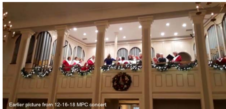
Earlier picture from 12-16-18 MPC concert

Saturday, June 1st 3:00 PM Going Places ! Trinity Episcopal Church, 708 South Bethlehem Pike, Ambler PA, 19002